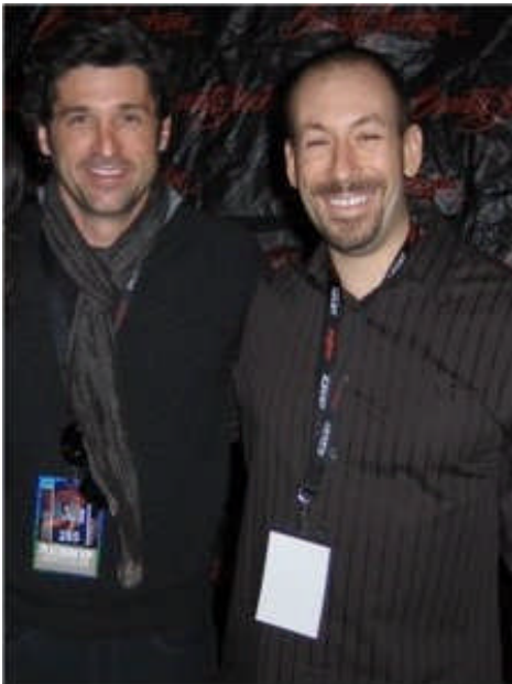
Patrick Dempsey aka McDreamy.

Nobel Peace Prize, Gandhi Peace Prize AND Presidential Medal of Freedom Winner.