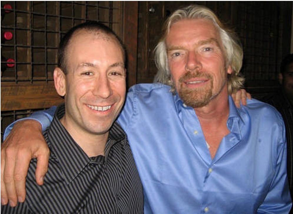
Chillin' out maxin' relaxin' all cool With Sir Billionaire Branson aka Dr. Rich

The "Lesson" can be best described through four pictures: