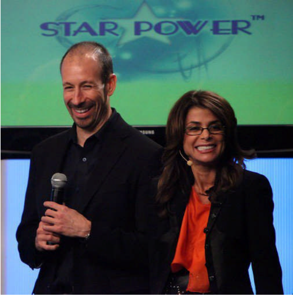
Just putting on a seminar with Paula Abdul...