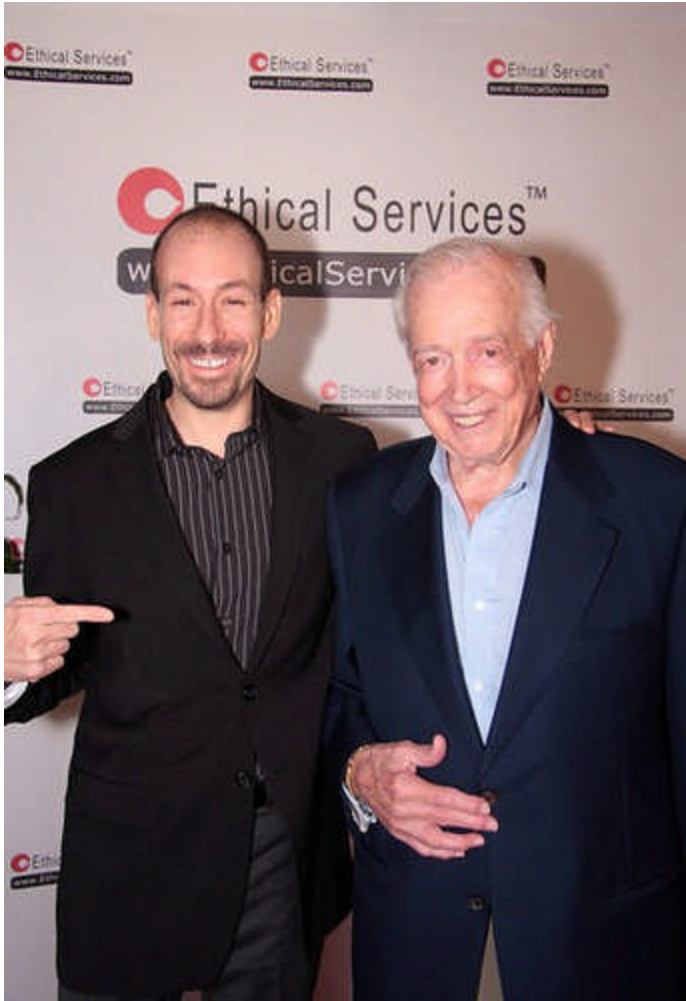
Hangin' With Hugh.

He's got the swagger and pimp of Hefner with added refinement.