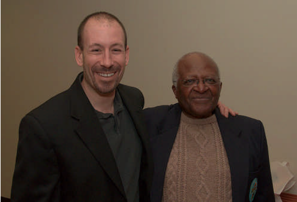
The distinguished Desmond Tutu.

Nobel Peace Prize, Gandhi Peace Prize AND Presidential Medal of Freedom Winner.